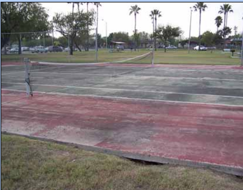
The condition and appearance of parks and facility improvements contributes to usage rates.

Objective 1.3: Review the parkland dedication requirements (Section 155.12, Standards and Specifications, of the Subdivision Rules) to consider establishing a formula for distributing