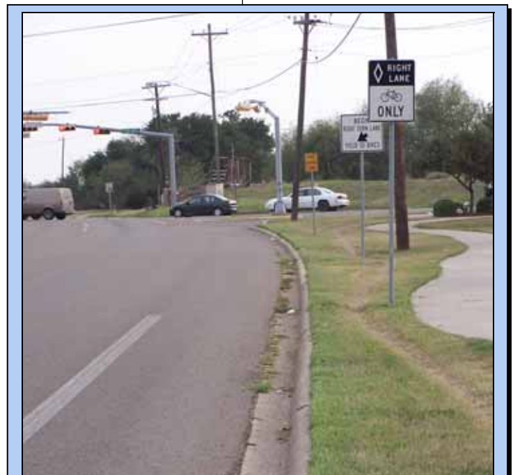
Striped on-street bicycle-only lanes and sidewalks as displayed above are an integral part of a comprehensive trail and bikeway network requiring a collaborative effort in the acquisition of adequate rights-of-way and design of roadway facilities.

Objective 4.7: Consider adoption of a policy by the City Council making sidewalks a priority