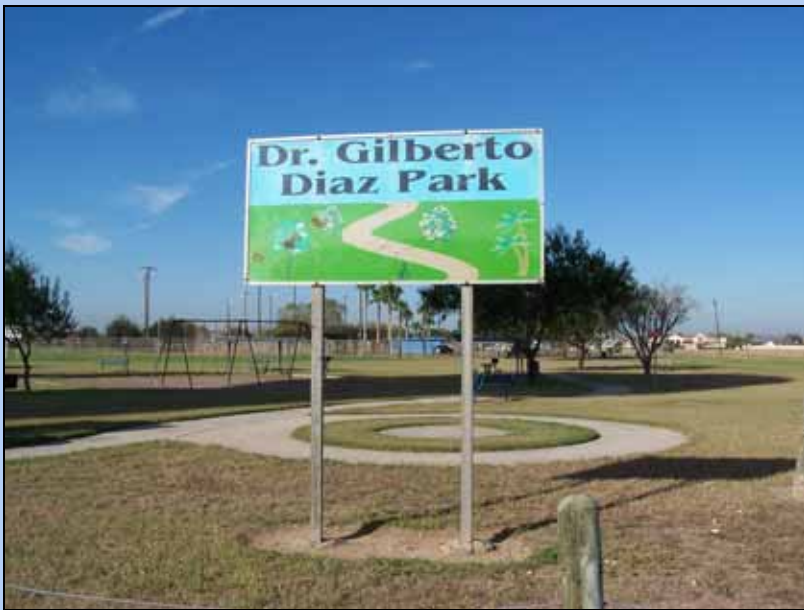
Consistent and attractive signage of the municipal park system is important to create an identity for public spaces.

Objective 3.4: Perform safety inspections to identify potentially harmful or dangerous conditions and create an itemized list of necessary repairs and improvements (refer to Appendix B, Park Assessment ).