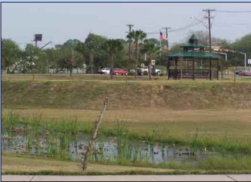
Integrating sensitive lands into the development of parks offers opportunities for public education and nature observance.

GOAL 5.0: Promote and engage in the conservation and enhancement of natural and cultural resources.